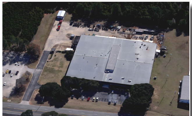
70,000 sq.ft. "Plant 3" facility, Longview, TX