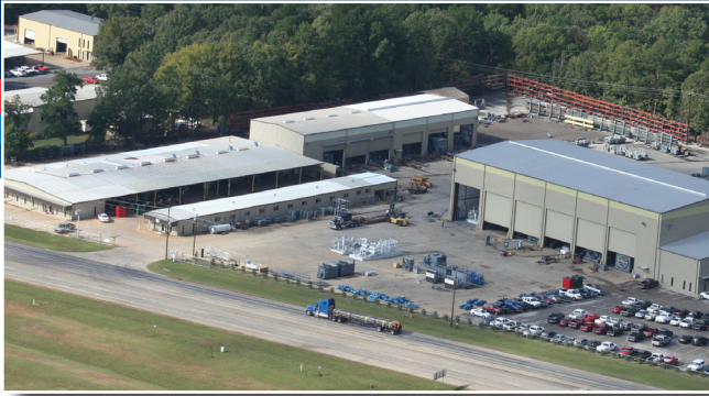
52,000 sq.ft. Longview, TX Plant

Whether its compression for trailer load, pipeline injection, trailer off-load, a gas fired or electric decant system including the entire fill and off load controls required for a biogas project, J-W POWER COMPANY has the equipment solution for you.