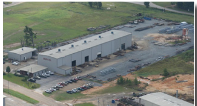
26,000 sq. ft. Kilgore, TX Plant